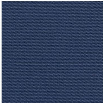
Canvas Navy 5439-0000